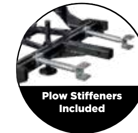
Plow Stiffeners Included

Light kit and replacement parts available for purchase.