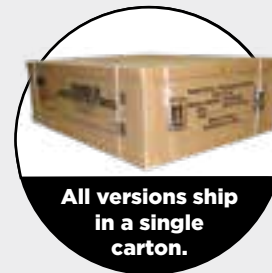
All versions ship in a single carton.