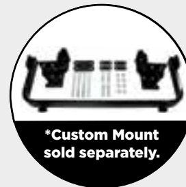
*Custom Mount sold separately.

All DK2 Snow Plows allow you to quickly & effectively remove snow from your driveway or small parking lot. DK2's range of personal plows each mount on to a vehicle specific custom mounting brackets. Ships in a single carton complete with hardened steel cutting edge scraper, rubber snow deflector, polymer-wrapped wire rope plow markers, skid shoes, castor kit for easy storage, and a 3,000lb wireless electric winch.