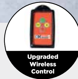
Upgraded Wireless Control