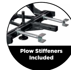
Plow Stiffeners Included

Light kit and replacement parts available for purchase.