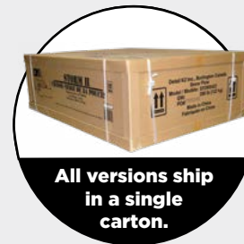
All versions ship in a single carton.