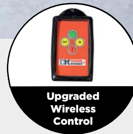
Upgraded Wireless Control