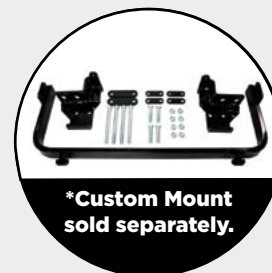
*Custom Mount sold separately.