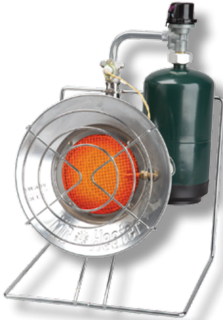
Shown with a 1 lb. LP tank (sold separately)