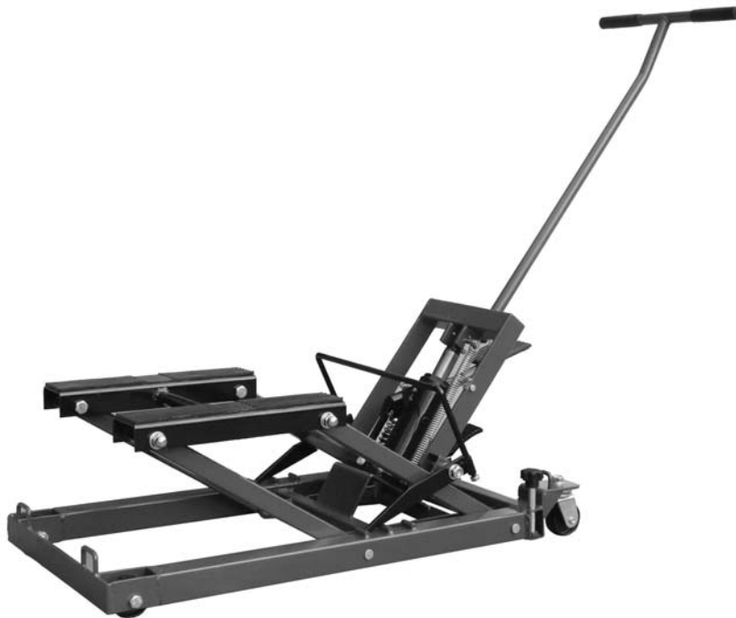
Motorcycle/ATV Jack Model Number: ATD-7461A