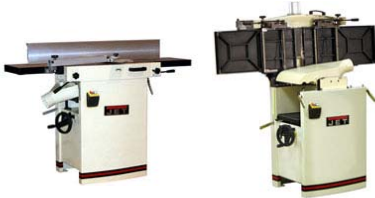
The JET JJP-12 Jointer-Planer brings two crucial woodworking processes, jointing (left) and planing (right) to the shop in one space and money saving package.

A frustrating choice woodworkers often face is whether to get a jointer or a planer first. That choice is made more difficult because these machines compliment each other to dimension, square and smooth the wood. The new JET JJP-12 Jointer-Planer eliminates that problem and brings both capabilities to your shop in one accurate, durable and economical package.