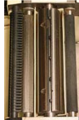
The precision machined 3-knife cutterhead and feed roller system (planing mode) make the JET JJP-12 effective.

The JET JJP-12 Jointer-Planer uses a large 2 3/4"-diameter cutterhead fitted with three high quality knives for both jointing and planing operations. The cutterhead turns at 5500 RPM for all operations. The knives are retained with conventional wedge bars and have jacking screws that make setting their height precisely much easier. Because this cutterhead is used for both jointing and planing, setting the knives one time is all that is required.