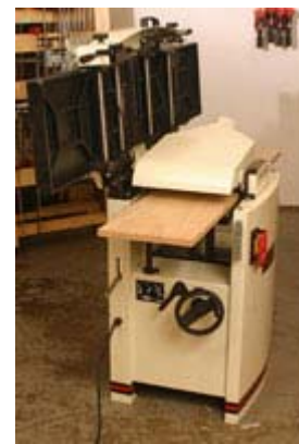
In the planer mode the JJP-12 handles boards up to 12" wide with power to spare.

The JET JJP-12 Jointer-Planer was designed to bring the much needed jointing and planing capabilities to your shop in a single, space-saving 55"-long by 39 1/2"-tall (top of fence) and 32"-deep (fence at its widest setting) package. Because of its space saving design and our focus on accuracy, function and durability, the JET JJP-12 Jointer-Planer is as economical as it is versatile.