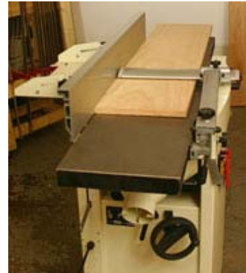
The JET JJP-12 has a whopping 12" jointing width capacity! The fence and fully adjustable infeed and outfeed tables make this an extremely versatile machine.

The 43"-long by 6"-tall extruded aluminum smooth faced fence makes accurate jointing easy. The fence is fully adjustable for material width using a pair of wide spread levers for maximum stability. The fence face can be set to any angle from 0 to 45-degrees for precise bevel cuts. A handy bevel scale and pointer are included on the fence mount.