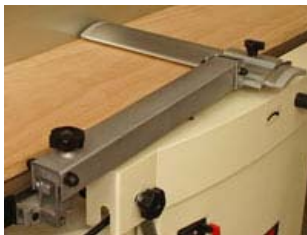
The bridge style guard is very effective and easy to set up.

The bridge style cutter guard may take a little getting used to but is much safer than the "pork chop" shaped guards. This style guard is simple to set up and with just a little experience will actually be easier for many than dealing with the swing-away guards.