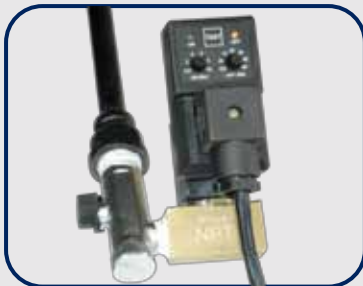
Auto Tank Drain eliminates daily maintenance