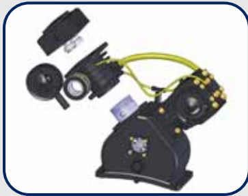
Flow-Tek™ Concentric Disc Valves for Maximum Performance & Longevity