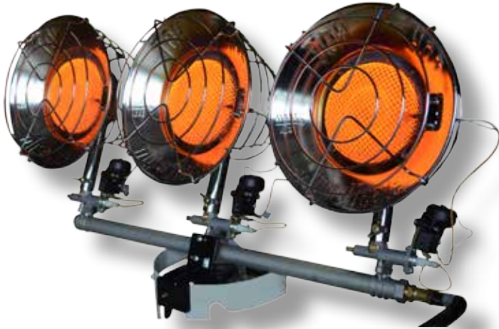
Shown on a 20 lbs. LP tank (sold separately)