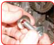
1. Select Installer Plate Bush