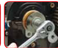
4. Engage and Tighten Bolt to Install Seal