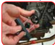
4. Remove Seal