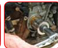
4. Engage and Tighten Bolt to Install Seal