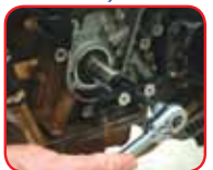
3. Attach Puller