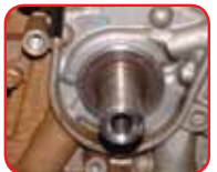
1. Remove Pulley