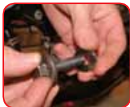
1. Select Installer Plate Bush