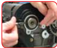
2. Insert Seal Extracting Hooks