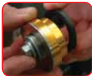
3. Select Mandrel to Match Seal