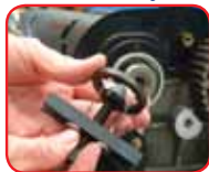
4. Remove Seal