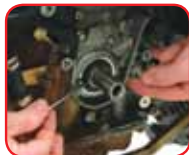
2. Insert Seal Extracting Hooks