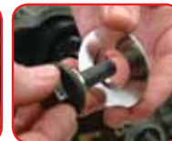
2. Insert into Installer Plate