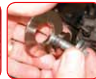
2. Insert into Installer Plate