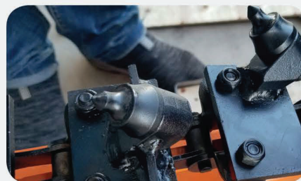
Tri-Cut High Carbide Teeth