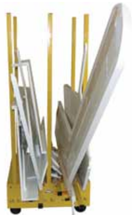
Tear Out Dolly

Shown with optional Wheel Barrow Handles