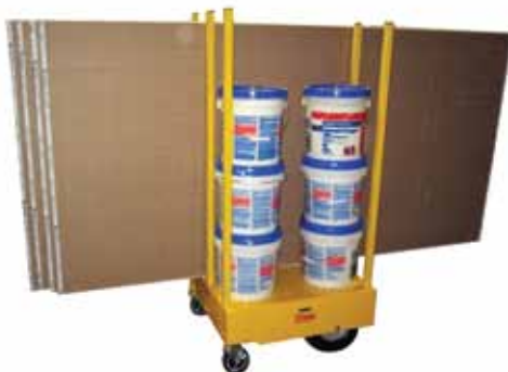
Dry Wall Dolly