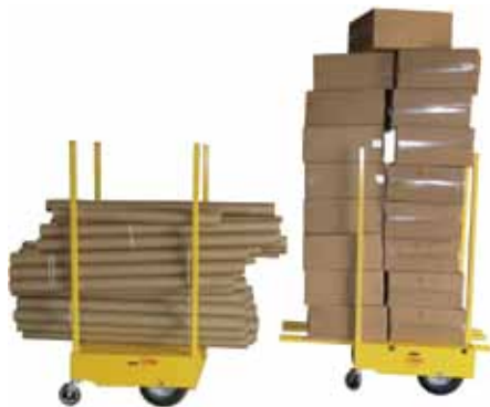
Box and Tube Dolly