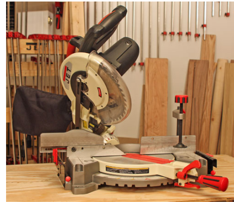
The JET 10" Compound Miter Saw has the capacity, accuracy and durability you expect from JET.