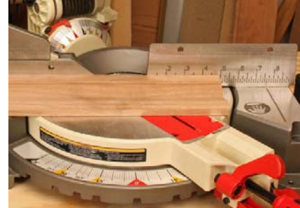
The spacious table (left) helps keep the wood stable during the cut. The handy scales (right) around the moveable miter table, at the bevel pivot and on the fence to make working faster and more accurate.

The table portion also has holes for securing the JET 10" Compound Miter Saw to the work surface for maximum safety and accuracy. We also include a tool-free work hold-down clamp that can be positioned to either side of the blade.