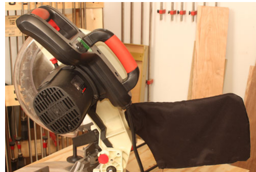
The motor is mounted high to increase capacity. The dust bag and the scoop-shaped chute help keep the work area clean.

Whether you are working in the shop or on the jobsite, the JET 10" Compound Miter Saw will make your square, bevel, miter and compound cuts more accurate. The large capacity, rugged construction and our 3-year warranty mean you can focus on the job at hand!