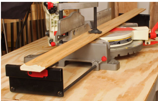
The pull-out work supports at each end of the table expand the overall supported work space to 42-3/4"!

The table portion also has holes for securing the JET 10" Compound Miter Saw to the work surface for maximum safety and accuracy. We also include a tool-free work hold-down clamp that can be positioned to either side of the blade.