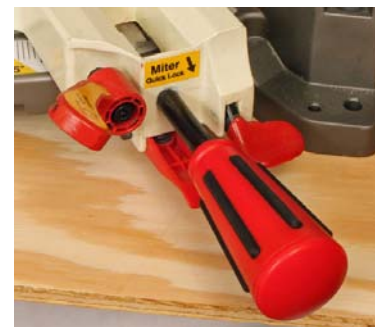
All of the critical controls are on the front where they are easy to access and simple to use.

The operating arm features a comfortable grip with an embedded On/Off trigger switch that reduces the chance of accidental startups. Also atop the operating arm is a comfortable handle for carrying the JET 10" Compound Miter Saw to the job. This handle is properly located so the saw is balanced to make carrying it less tiring. A full