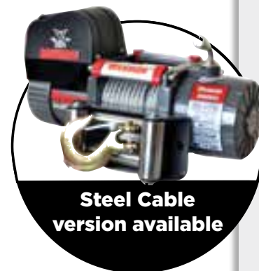
Steel Cable version available

The Short Drum winch is the preferred choice of the British Military on specialist vehicles currently serving in action. Available with synthetic rope and aluminium fairlead, to give a total weight of 44 lbs.