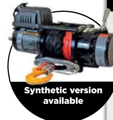
Synthetic version available

The silky smooth performance and the full load holding brake make it the perfect solution for high spec applications.