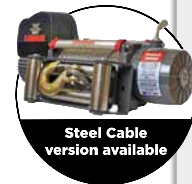
Steel Cable version available

Complete with heavy duty integrated wireless remote. Available with Steel Rope or Armortek Synthetic Rope and Aluminum Fairlead.