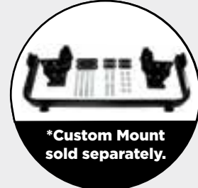
*Custom Mount sold separately.