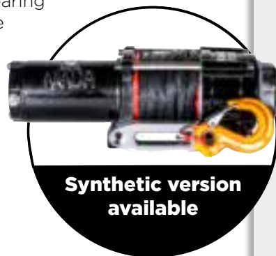
Synthetic version available

Watertight 4 Pin connection allows the use of 'Plug and Play' Wireless.