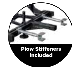
Plow Stiffeners Included

Light kit and replacement parts available for purchase.