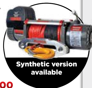
Synthetic version available

Comes with stainless steel roller fairlead and fittings as standard. Complete with Heavy Duty integrated wireless remote. Available with Armortek Synthetic Rope and Aluminum Fairlead.