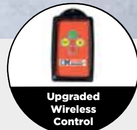
Upgraded Wireless Control