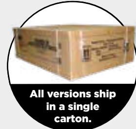
All versions ship in a single carton.