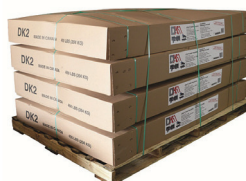
SHIPS IN A STACK OF 10