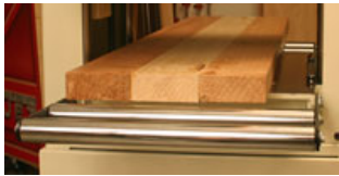
Table and Extensions

The main cast iron table and the twin-roller extensions add up to 36 1/2" of support that makes working with large pieces of wood much easier.