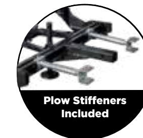
Plow Stiffeners Included

Light kit and replacement parts available for purchase.