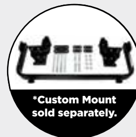
*Custom Mount sold separately.