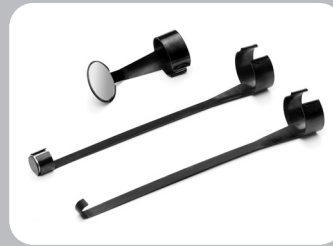
Hook, Magnet, Mirror