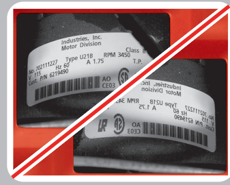
180° Digital Rotation