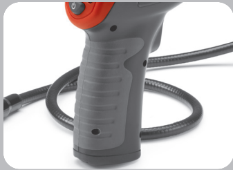
Pistol Grip Design for Easy One-Handed Operation