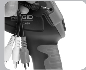
TV Out and RCA Cable