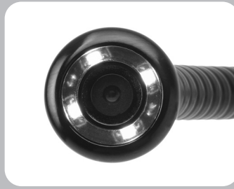
Waterproof Aluminum Imager Head and Cable with 4 Adjustable Ultra-Bright LEDs