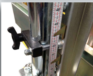
Dual Rip Pointers