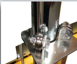
Sealed Steel Roller Bearings